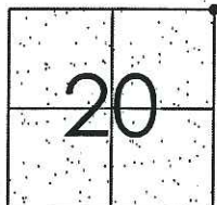
T4N R7E MDB&M

Brief Legal Description DUSTIN ROAD @ PELTIER ROAD