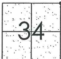
T3S R5E MDB&M

Brief Legal Description CHRISMAN ROAD @ STATE ROUTE 132