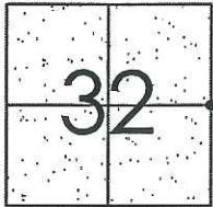
T4N R6E MDB&M

Brief Legal Description DAVIS ROAD 2595' +/- & 2645' +/- NORTH OF TURNER ROAD