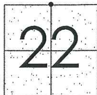
T1S R8E M.D.B. & M.

Brief Legal Description AVENA ROAD 2636'+/- WEST OF CARROLTON ROAD