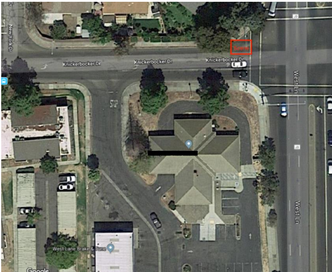
Google Maps Overview of West Lane and Knickerbocker Drive