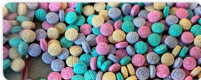
*FAKE rainbow oxycodone M30 tablets containing fentanyl