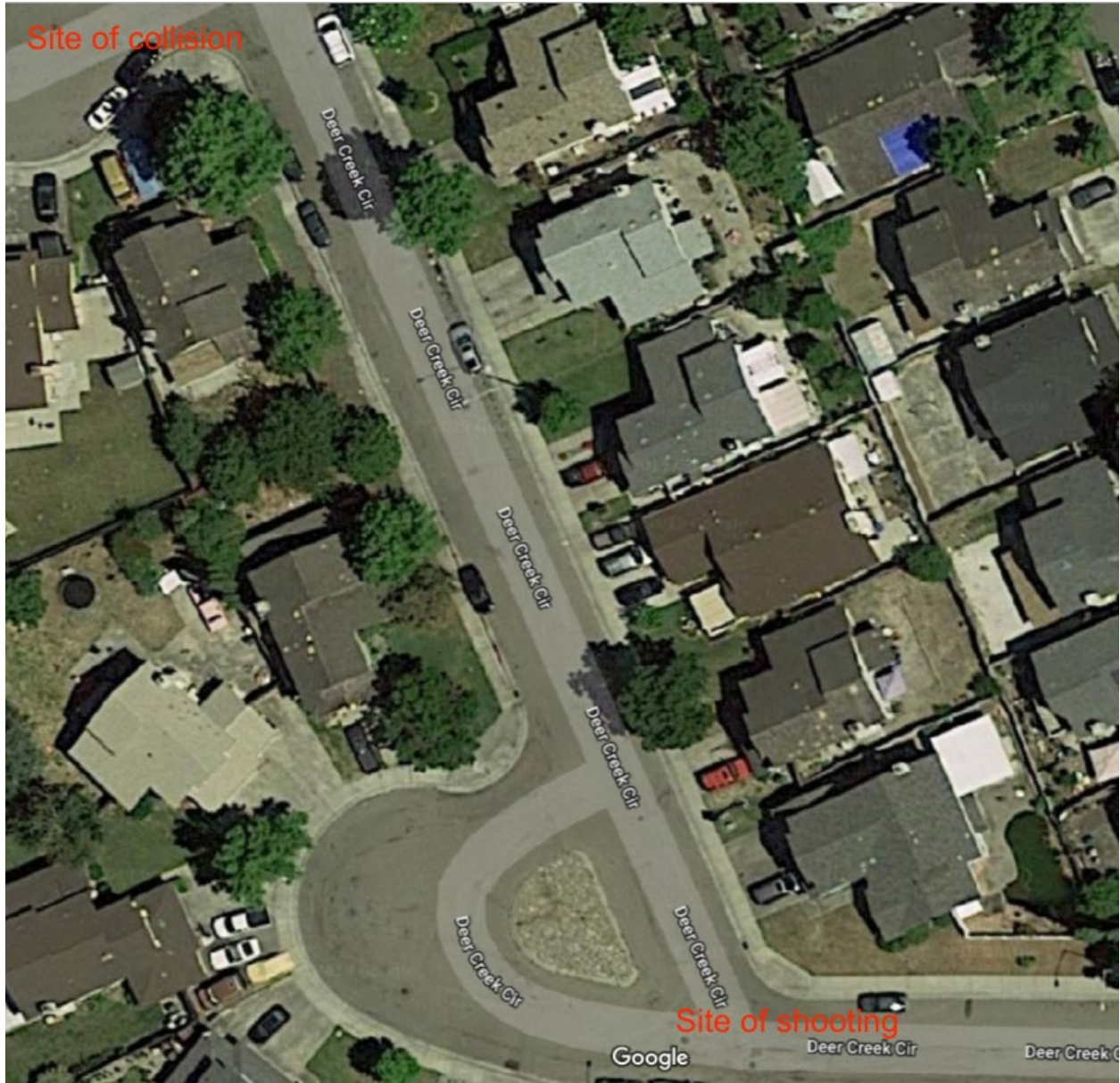
Collision site relative to the site of the shooting – Google Maps.