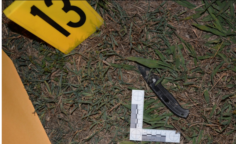
Mr. Doll's folding black knife at Marker 13. (Photograph by MAIT).