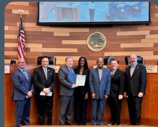
Juneteenth National Freedom Day Proclamation

This is a legacy project for San Joaquin County. Our vision: a transformational behavioral health and substance use disorder treatment facility that will serve as the cornerstone of a more compassionate, coordinated, and effective behavioral health system in the County. This project also supports our Three-Year Strategic Priorities which include supporting a healthy community by making investments in health care infrastructure and services that enhance access to physical and behavioral health care, and improve health outcomes. This campus will provide much-needed access to care for residents who need it most. The entire campus is on track to be fully operational in two years.