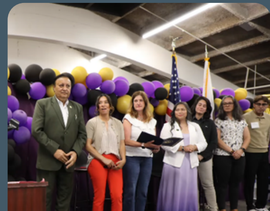
Inaugural Women Veterans & Military Service Members Summit