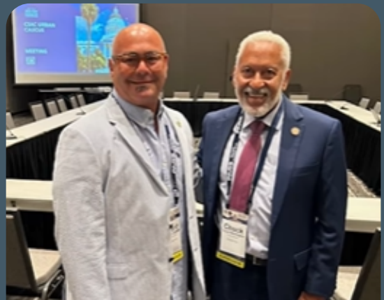
California State Association of Counties (CSAC) Legislative Conference