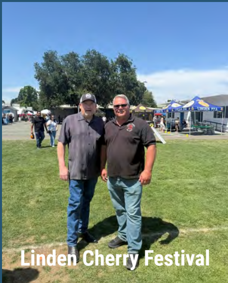
Linden Cherry Festival