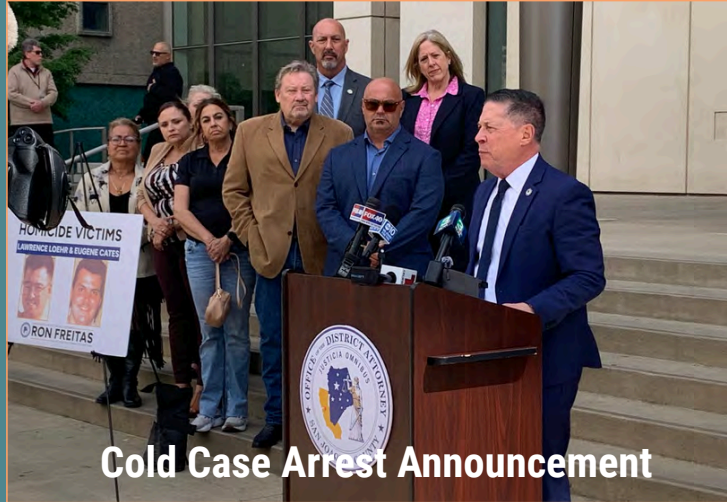
Cold Case Arrest Announcement