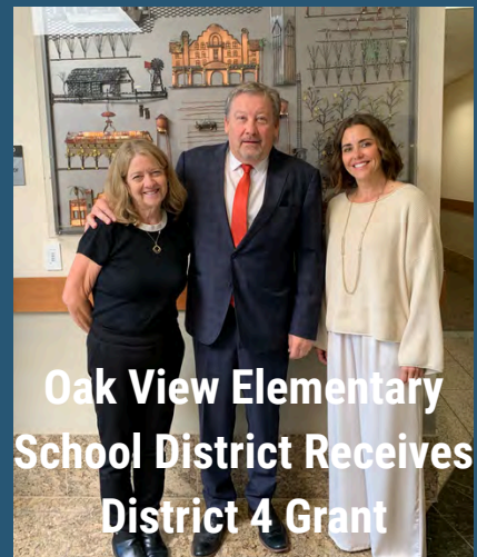
Oak View Elementary School District Receives District 4 Grant