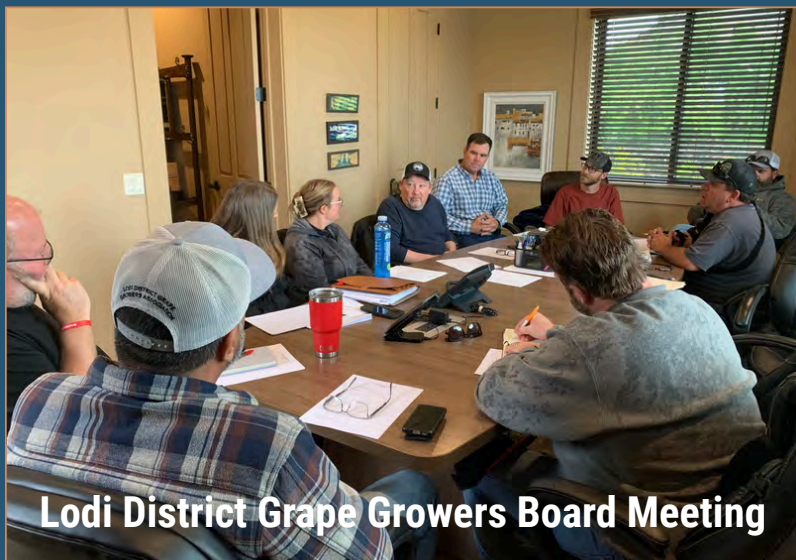
Lodi District Grape Growers Board Meeting