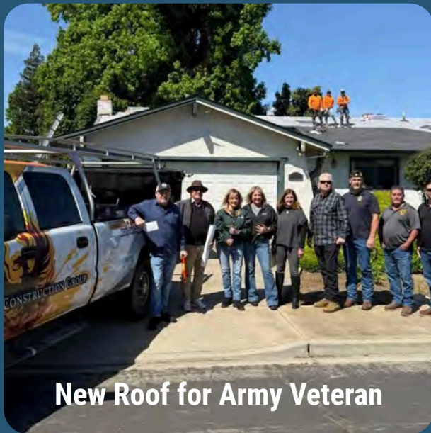
New Roof for Army Veteran