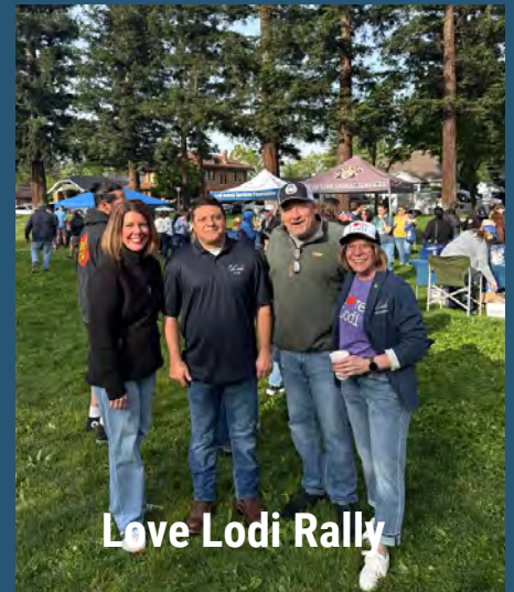
Love Lodi Rally