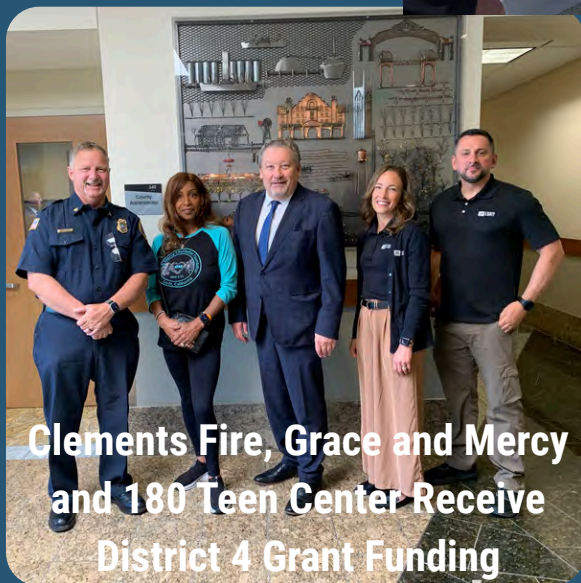
Clements Fire, Grace and Mercy and 180 Teen Center Receive District 4 Grant Funding