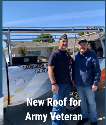
New Roof for Army Veteran