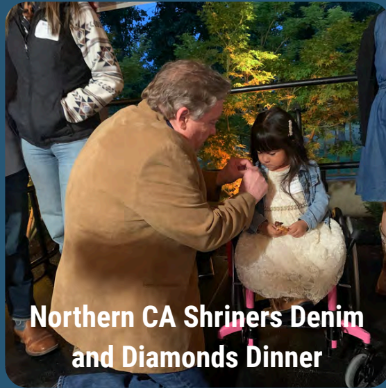
Northern CA Shriners Denim and Diamonds Dinner