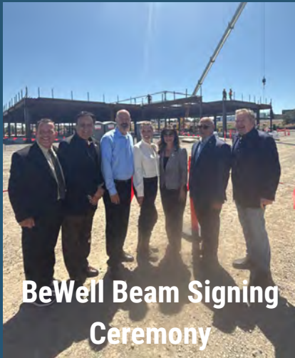
BeWell Beam Signing Ceremony