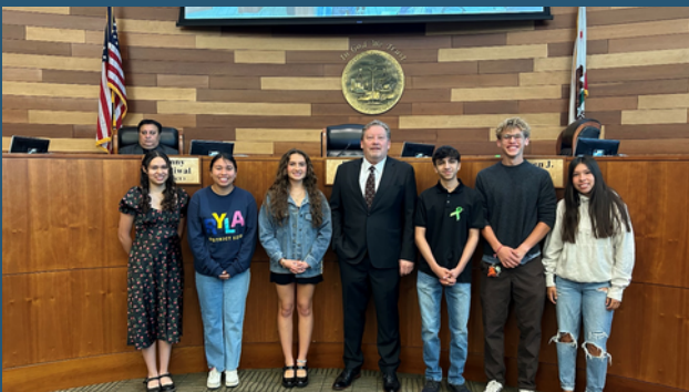
Supervisor Ding recognized the 2025 Rotary Camp RYLA student leaders at the May 13 th Board Meeting

Parks and recreation are a vital part of a healthy community. The Board's strategic priorities include supporting health infrastructure and advocating for more parks and open space to allow families more options for safe outdoor play.