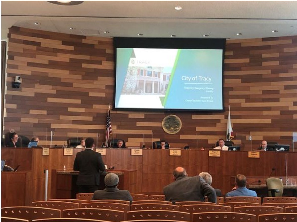
IMAGE: Presentation by San Joaquin Cities of Lodi, Manteca and Tracy to Request Funding for Emergency Homeless Shelters within Their Cities and Approval of Related Budget Adjustments in the Amount of $6 Million Dollars