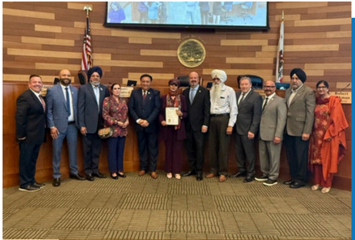
Recongizing Sikh-American Heritage Month in San Joaquin County.