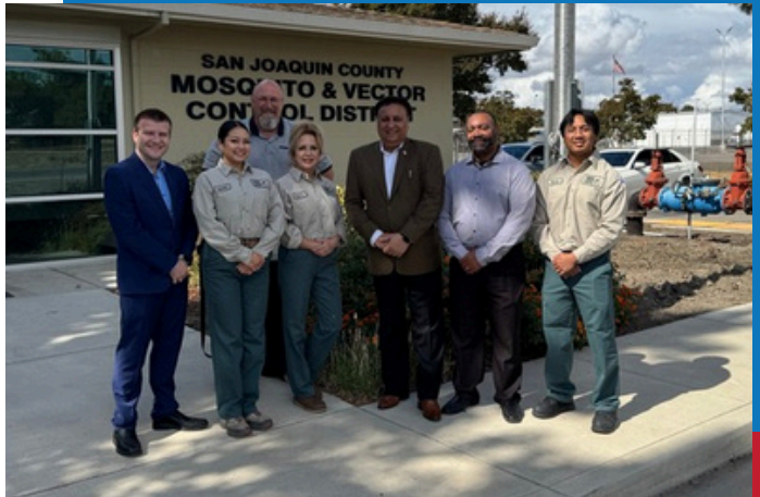
Attending a tour of the San Joaquin County Mosquito & Vector Control District Office.