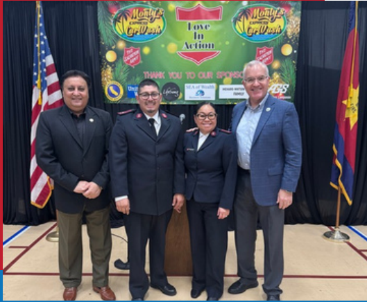
Attending the Salvation Army Kettle Kickoff Luncheon.