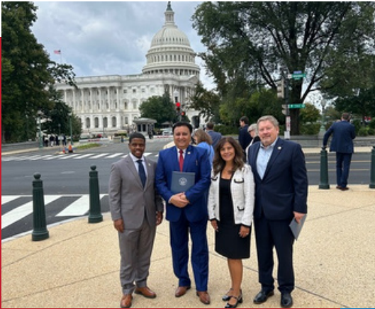
In the fall, the Board joined key County staff on a advocacy trip to Washington, DC.