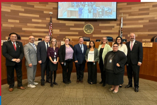
Celebrating with the Clerk of the Board's Staff during Clerk's Week in San Joaquin County.