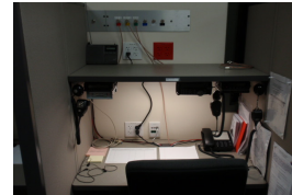
XSJ OA-EOC RACES stations